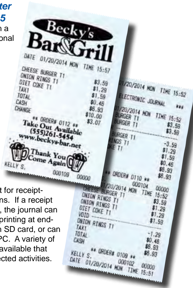
Receipt Featuring Graphic Logo and Message Shown 75% Actual Size

Single printer models are best for receipt-only or journal-only applications. If a receipt and a sales journal is needed, the journal can be archived electronically for printing at end-of-day, can be collected on an SD card, or can be polled and collected by a PC. A variety of electronic journal reports are available that allow you to quickly audit selected activities.