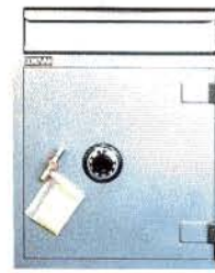
RH2014 RH2021 LM2020MB