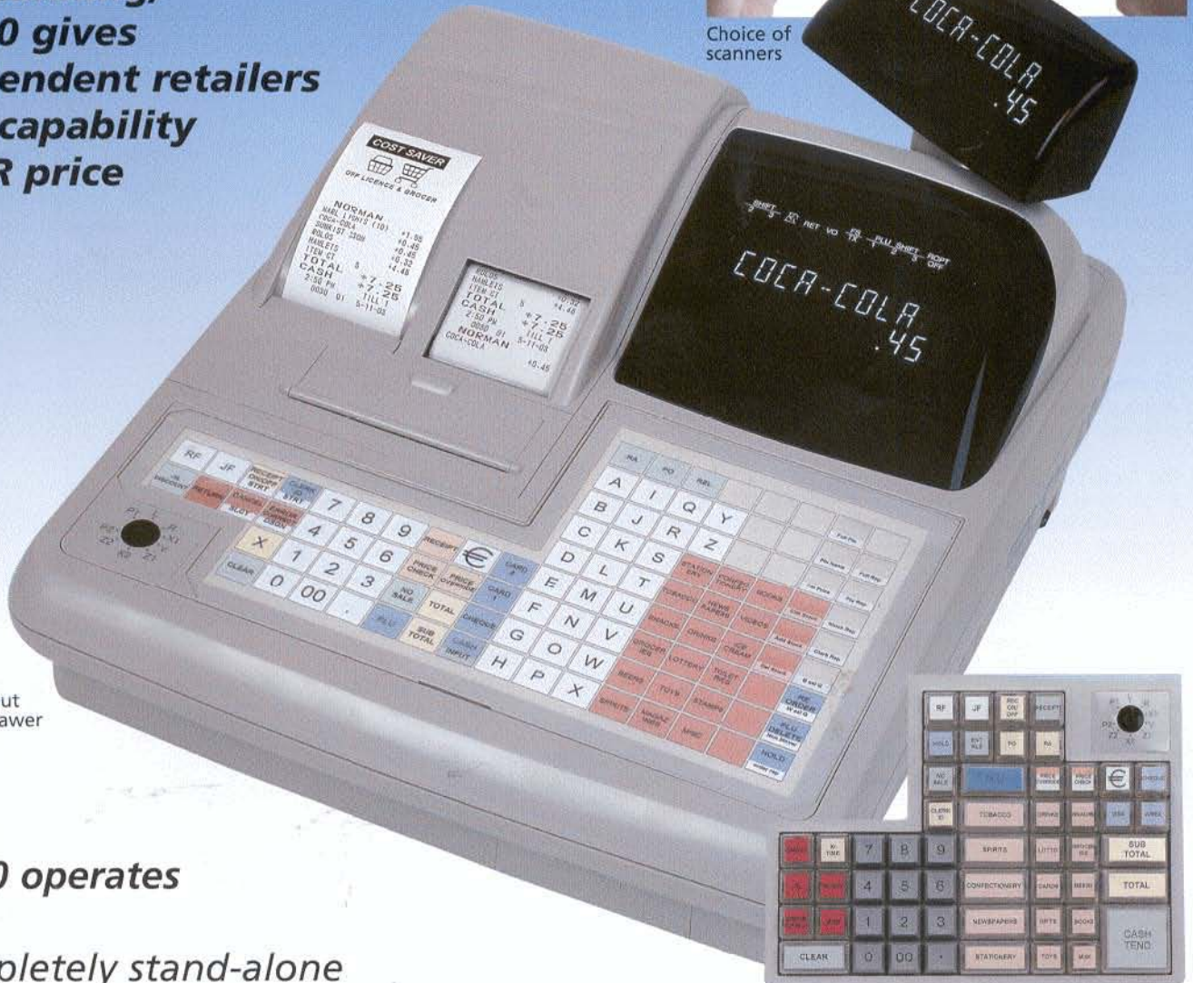
Shown without cash drawer