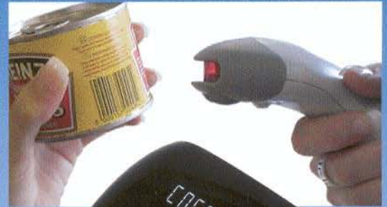
Choice of scanners

With up to 20,000 product lines and scanning, SX-680 gives independent retailers EPOS capability at ECR price