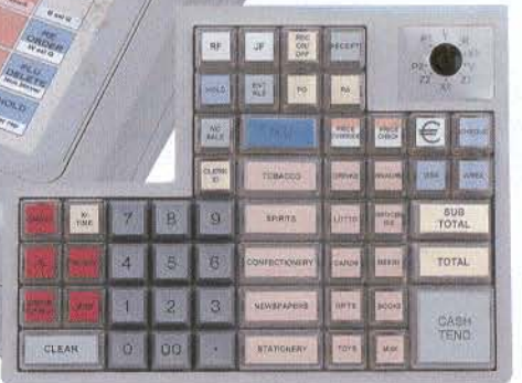
Option of raised button keyboard

SMART ECR SYSTEMS THAT DO MORE - COST LESS